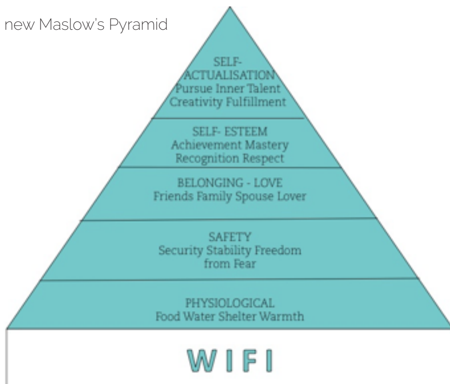
Fig. 1. The new Maslow's Pyramid