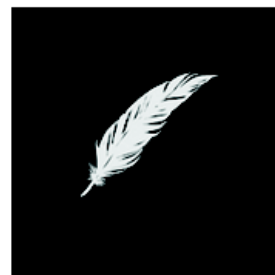
Freelance en Europe