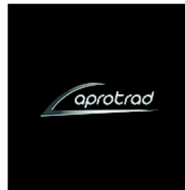
Association professionnelle des metiers de la traduction