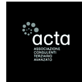
Associazione Consulenti Terziario Avanzato