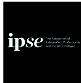
IPSE – Association of Independent Professionals and the Self Employed