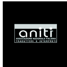
Associazione Nazionale Italiana Traduttori e Interpreti