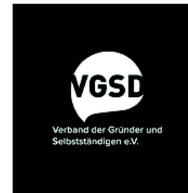
Verband der Gründer und Selbständigen