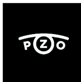
Platform Zelfstandige Ondernemers