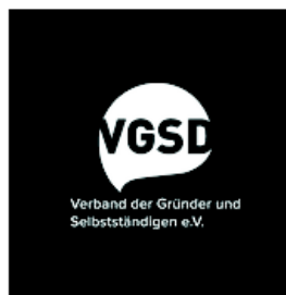
Verband der Gründer und Selbstständigen