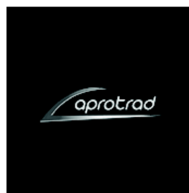
Association professionnelle des metiers de la traduction