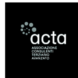
Associazione Consulenti Terziario Avanzato