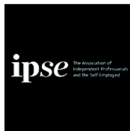
IPSE – Association of Independent Professionals and the Self Employed