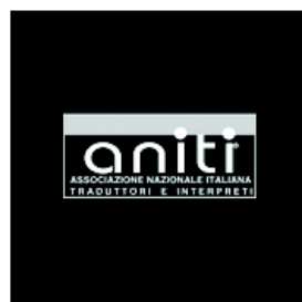
Associazione Nazionale Italiana Traduttori e Interpreti